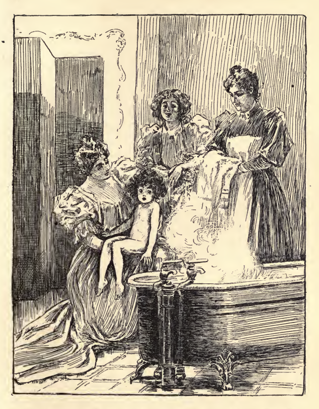
"'1 AM GOING TO WASH YOU MYSELF,' SAID LADY AILEEN, LIFTING HIM IN HER STRONG WHITE ARMS''